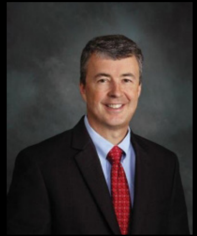
Attorney General Steve Marshall