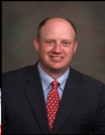
Lieutenant Governor Will Ainsworth