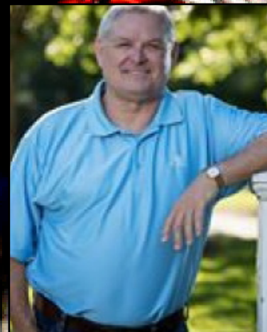
State Commissioner of Agriculture Rick Pate