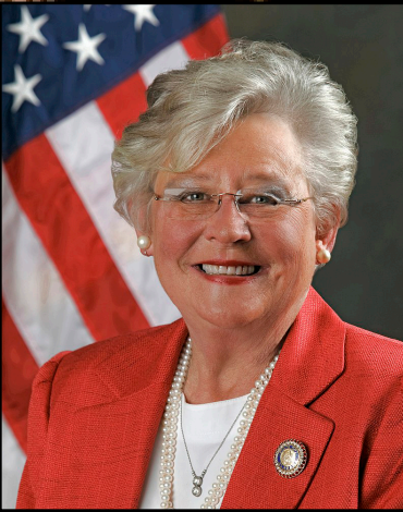
Governor Kay Ivey