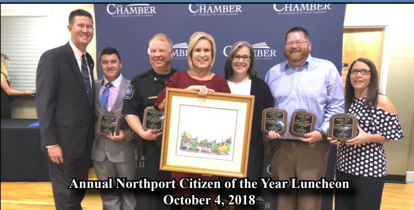
Annual Northport Citizen of the Year Luncheon October 4, 2018