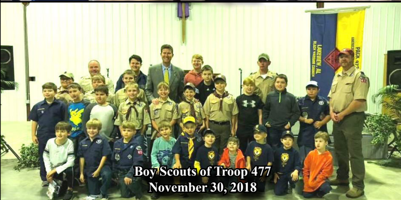
Boy Scouts of Troop 477 November 30, 2018