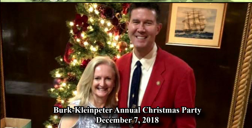
Burk-Kleinpeter Annual Christmas Party December 7, 2018