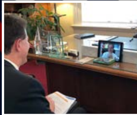
Date: June 3, 2020 Alabama delegation for the United States Global Leadership Coalition meeting with Senator Doug Jones to discuss the coronavirus and federal assistance related to the virus.