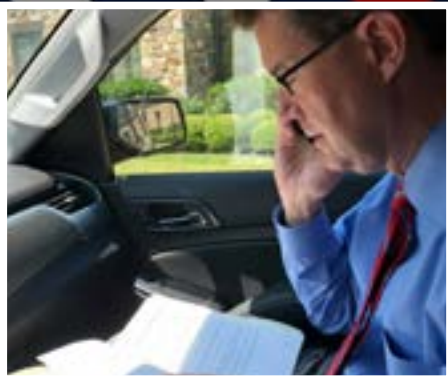
Date: June 2, 2020 Conference call with the Republican Secretaries Of State Committee.