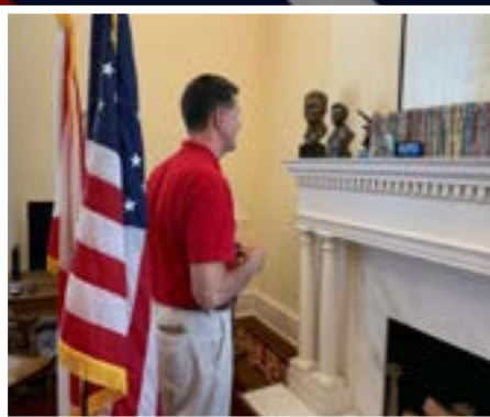
Date: April 10, 2020 Interview with Wiregrass Strong to discuss the upcoming election.