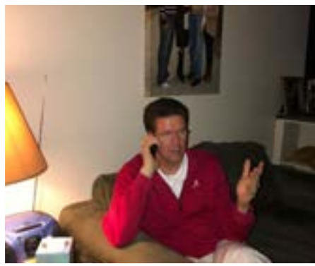
Date: April 1, 2020 Conference call with the Presidents of the various chapters of Republican women from around the state of Alabama to explain the process for delaying the runoff election and the implementation of the relief appropriation.