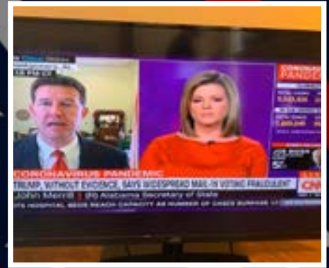
Date: May 26, 2020 Interview with Brianna Keilar on CNN about the runoff scheduled for July 14.