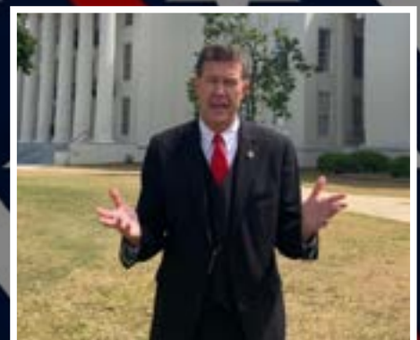
Date: May 13, 2020 Motivational video message for the Tharps town High School Class of 2020.