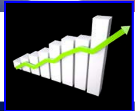
Take a Look at his Quarter's List of Accomplishments