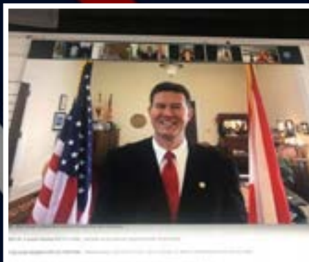
Date: April 21, 2020 Zoom meeting with the members of the Downtown Republican Women in Huntsville to explain the steps the SOS Office has taken to preserve the integrity and credibility of the elections process in the runoff and beyond.