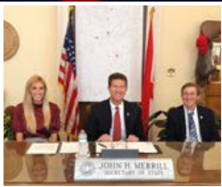
Date: June 11, 2020 Testifying via video chat before the United States House of Representatives Committee on Administration. Invited by Illinois Congressman Rodney Davis to talk about the recent appropriation made available to all states for elections.