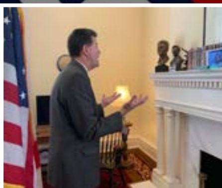
Date: May 6, 2020 Video meeting with several South Alabama Home School Students and Educators to discuss the Census and the Electoral College, the elections in July and November, and the importance of being a registered voter and voting.