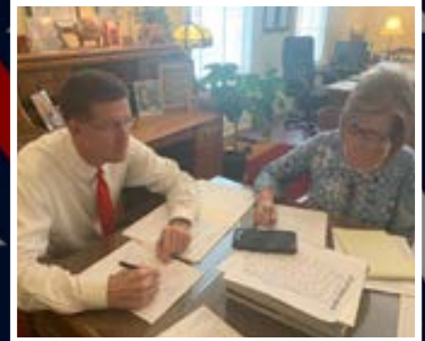
Date: April 7, 2020 Monthly meeting via teleconference of the Republican Secretaries of State from around the nation to discuss the preservation of the integrity and credibility of the elections process.