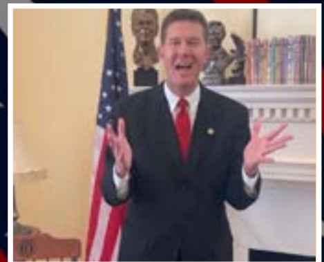
Date: April 22, 2020 Video message for Vietnam veterans thanking them for their service and recognizing their selfless contributions to the nation.