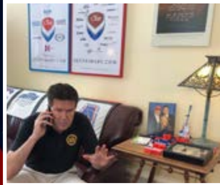
Date: April 2, 2020 Interview with the Toni And Gary Morning Show in Huntsville to discuss the runoff election scheduled for July 14 and the $2 trillion stimulus package recently passed by the United States Congress and how it impacts elections.