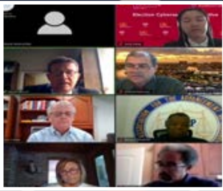
Date: May 19, 2020 Video meeting as the keynote speaker for The University of Southern California Election Cybersecurity Initiative Zoom presentation to discuss the steps that the SOS Office is taking to improve the strength in cybersecurity and fight the coronavirus.